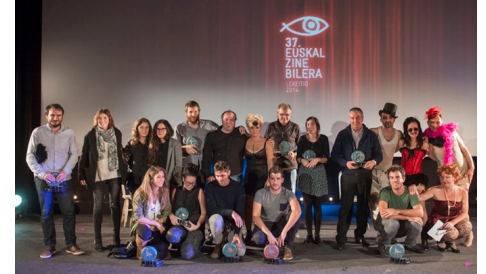
Winners of the contest Zinebilera 2014.